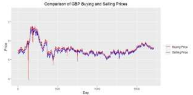
(b) GBP Non-Stationary Buying and Selling Prices at 1130