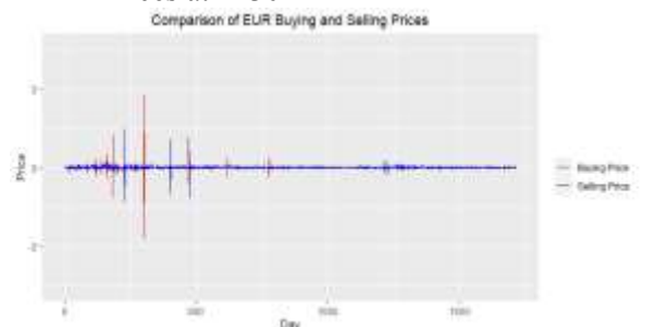
(c) EUR Stationary Buying and Selling Prices at 1130