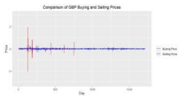
(b) GBP Stationary Buying and Selling Prices at 1130