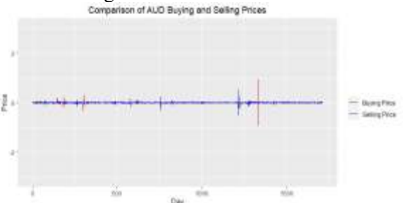
(e) AUD Stationary Buying and Selling Prices at 1130