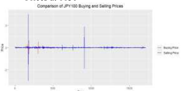
(d) JPY100 Stationary Buying and Selling Prices at 1130