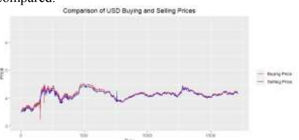
(a) USD Non-Stationary Buying and Selling Prices at 1130

On the non-stationary data, the trend of prices for the seven currencies can be seen in Fig. 2 with subfigures 2a, 2b, 2c, 2d, 2e, 2f, and 2g representing USD, GBP, EUR, JPY100, AUD, CAD, and SGD. From the graphs, two colors can be seen obviously. The buying price is represented by the red color while the selling price is blue. At the 1130 price, it is known to be the best price offered by merchant banks. Hence, it can be observed that the buying price is generally higher than the selling price which is quite consistent throughout the seven years though there are certain prices that show a different trend on certain days which can be seen from the crossovers of the two lines. Therefore, this trend contributes to the relatively high R^2 for all the currencies as observed by all the four models compared.