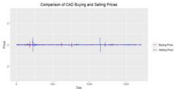
(f) CAD Stationary Buying and Selling Prices at 1130