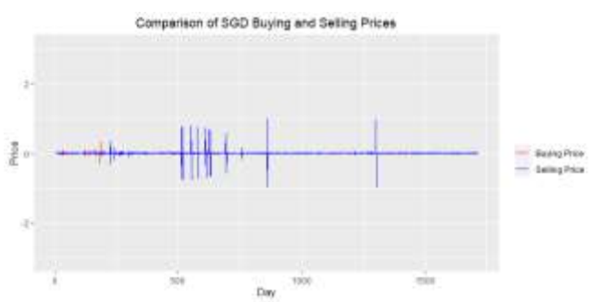
(g) SGD Stationary Buying and Selling Prices at 1130